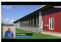
Max Air Curtain

This next generation system operates as a single curtain for openings up to 14'. For these larger openings the material rolls on and off an aluminum tube in the center of the opening which keeps the curtain fabric tight in all positions.